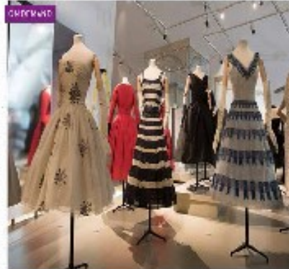
The Legacy of Dior →